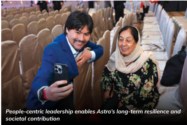
People-centric leadership enables Astro's long-term resilience and societal contribution