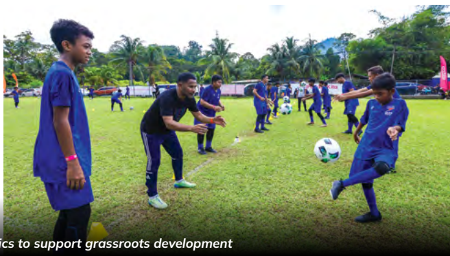
Astro volunteers restore a local community field and support football clinics to support grassroots development